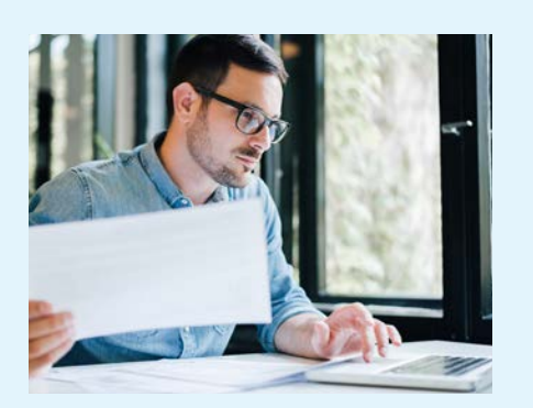
Start Anytime | Voucher Included 225 Course Hours | $2,695 #GES2034 | Location: Online

Paralegals play a vital role in the legal profession. They take on a variety of tasks ranging from legal research to drafting legal documents in law office settings and in the corporate, government and public arenas. Formal training is a critical part of preparing for a career as a paralegal. Train to become a paralegal and prepare for the National Association of Legal Assistants' Certified Paralegal exam. And, create a strong resume that encompasses your specialized skill set.