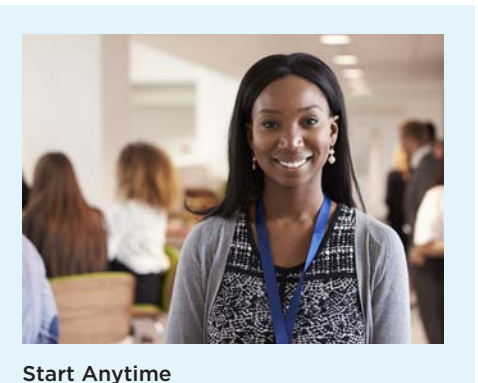
120 Course Hours | $1,995 #GES402 | Location: Online

Build a foundation that you can use to develop and accelerate a career in special events or start your own special event business. This course covers corporate events, weddings, parades, festivals, and more. Learn about the practicalities of planning events and the dazzle of designing them. From permits to pyrotechnics, this course will also teach you how to design, plan, implement and evaluate special events.